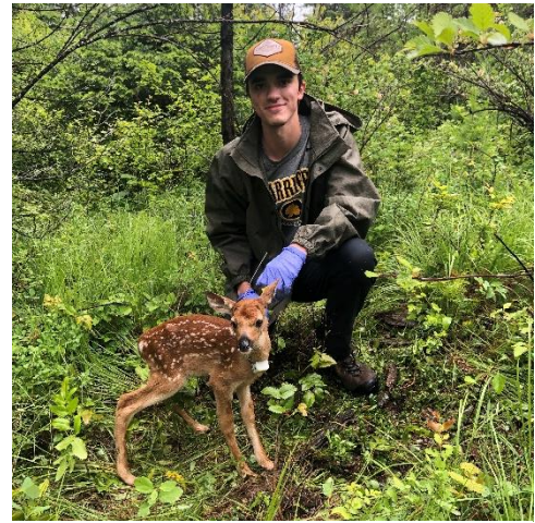
Collared fawns and calves offer valuable information on survival rates.